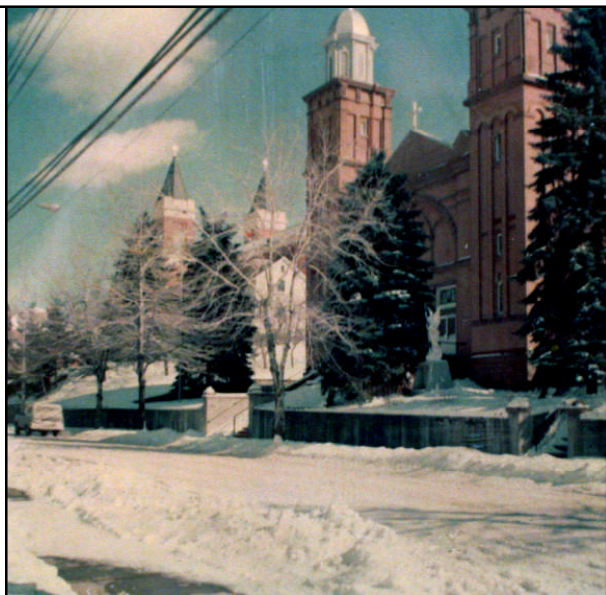
St. Michael's Church on West Main Street, Glen Lyon 2/26/74